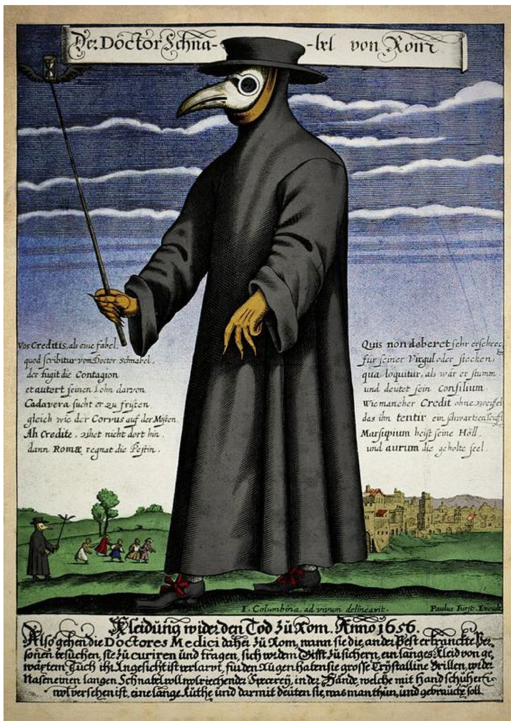
Fig. 1 Colored version of a copper engraving of Doctor Schnabel (i.e., Dr. Beak), a plague doctor in seventeenth-century Rome, circa 1656 by Paul Fürst (1608–1666) of Nuremberg made for a broadsheet, German derivate of a sheet of Sebastiano Zecchini, 1656