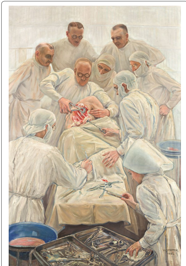
Fig. 3 Hermann Otto Hoyer (1894–1968) 1922 Sauerbruch in a thoracotomy, Museum of Medical History at the Charité, art collection Charité, picture Bruns Inv.-Nr. 123330, with kind permission

chair for surgery in Heidelberg, elaborately described the necessity of wearing a facemask in his multi-volume operational theory in the chapter ‘measures to combat infections’ [16]. In the following edition of the book